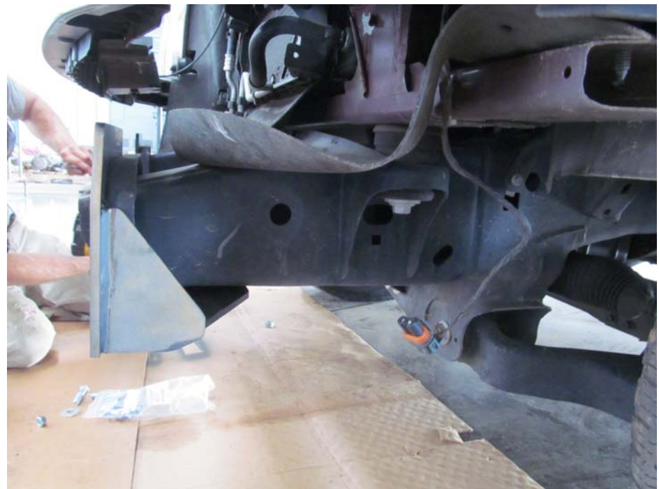
Figure 10: Driver side view of mounts