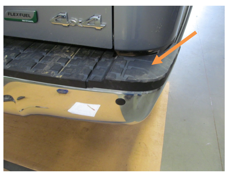
Figure 3: Passenger side plastic cover for bumper

5. Remove plastic corner piece that is on top of the chrome bumper on each side. Do this by depressing tabs underneath of bumper and pressing upward. See Figure 3, and Figure 4.