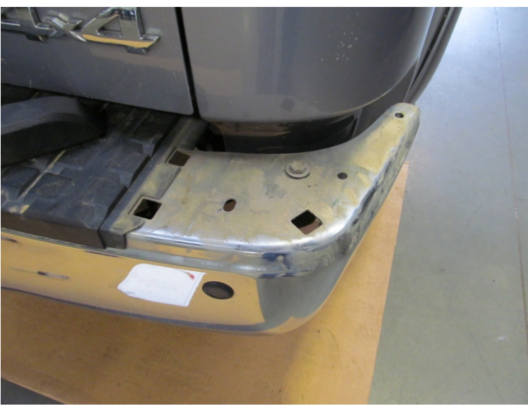
Figure 4: Passenger side Plastic cover removed from OEM bumper