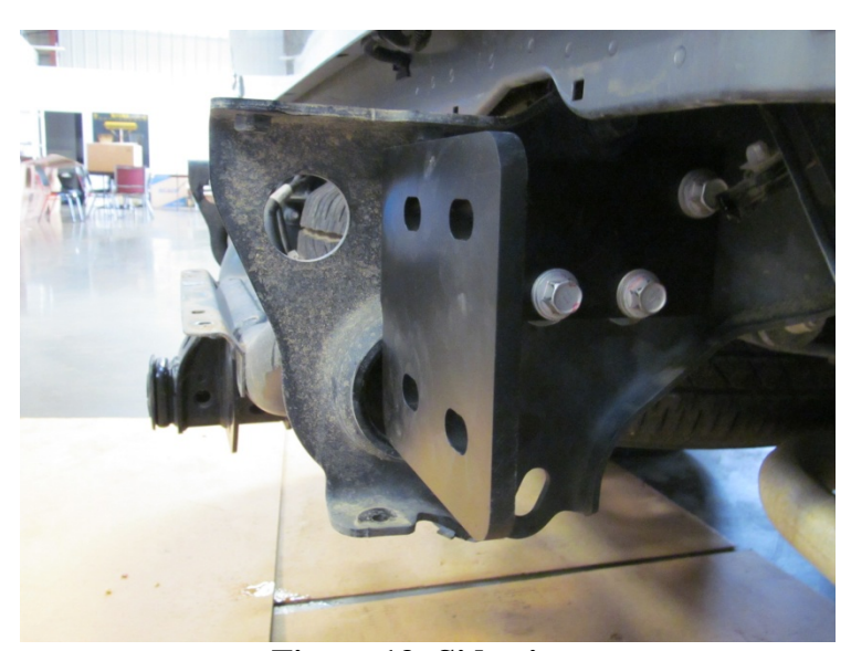
Figure 13: Side view