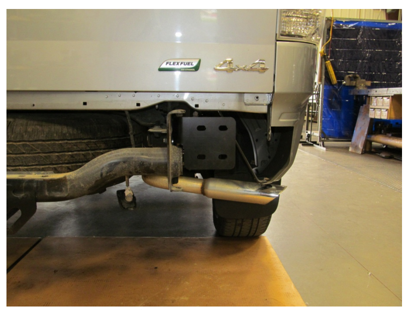
Figure 12: Front view

1. Using OEM bolts and 19mm socket, position Frame mounts as shown in Figure 12, and Figure 13.