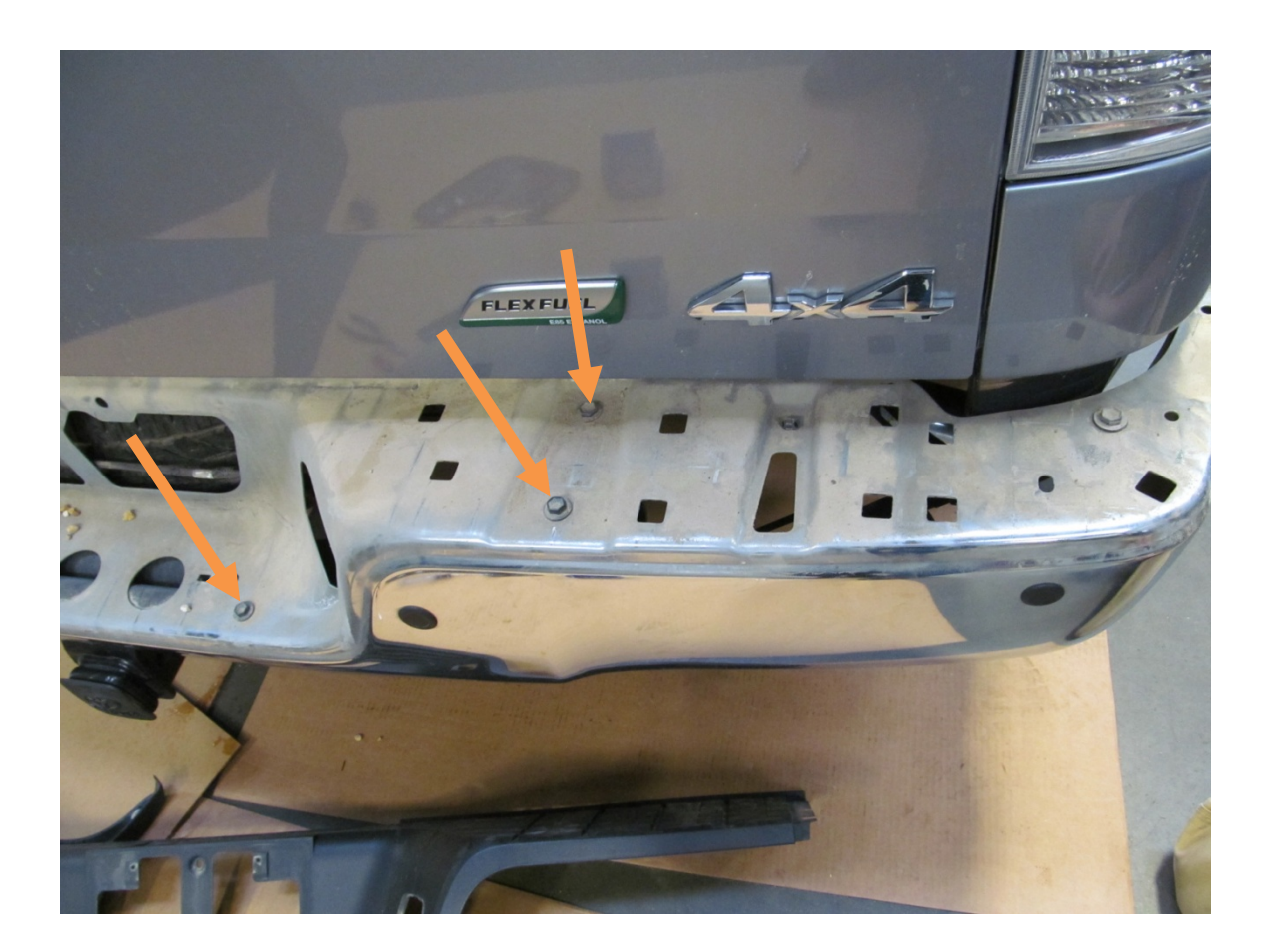
Figure 9: Location of Passenger side bolts to remove with 12mm socket/wrench