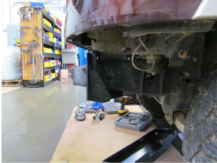
Figure 9: Side view of mount

2. Secure winch tray to frame mounts as shown in Figure 10.