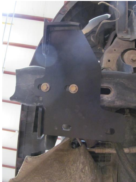
Figure 8: Bottom view of mount