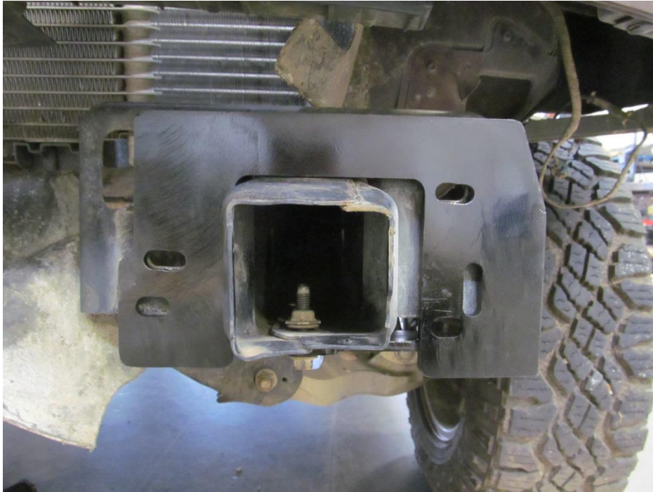
Figure 7: Front view of mount