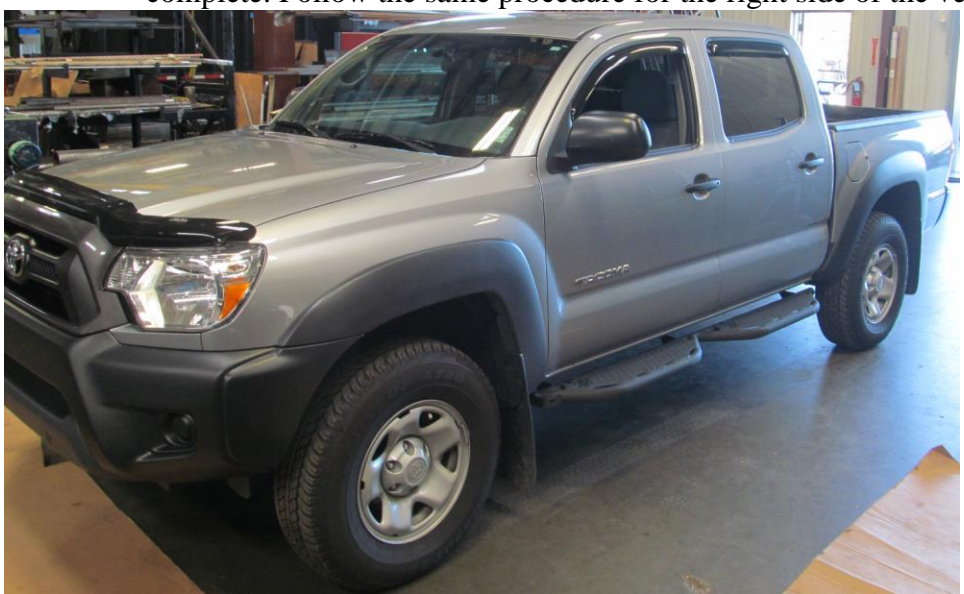
Congratulations! Your installation is now complete. Thank you for your purchase.