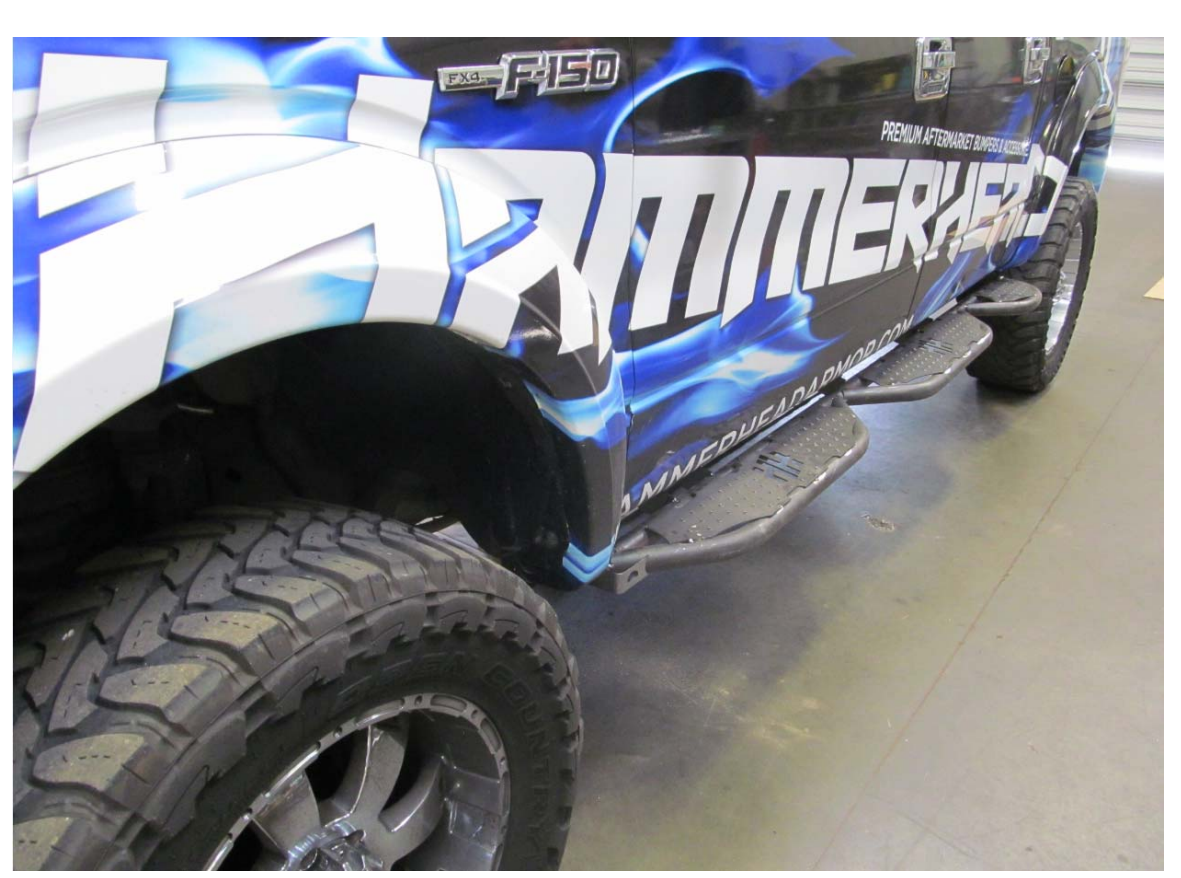
Congratulations! Your installation is now complete. Thank you for your purchase.