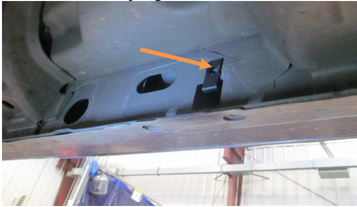
Rear mount - 2 spring nuts