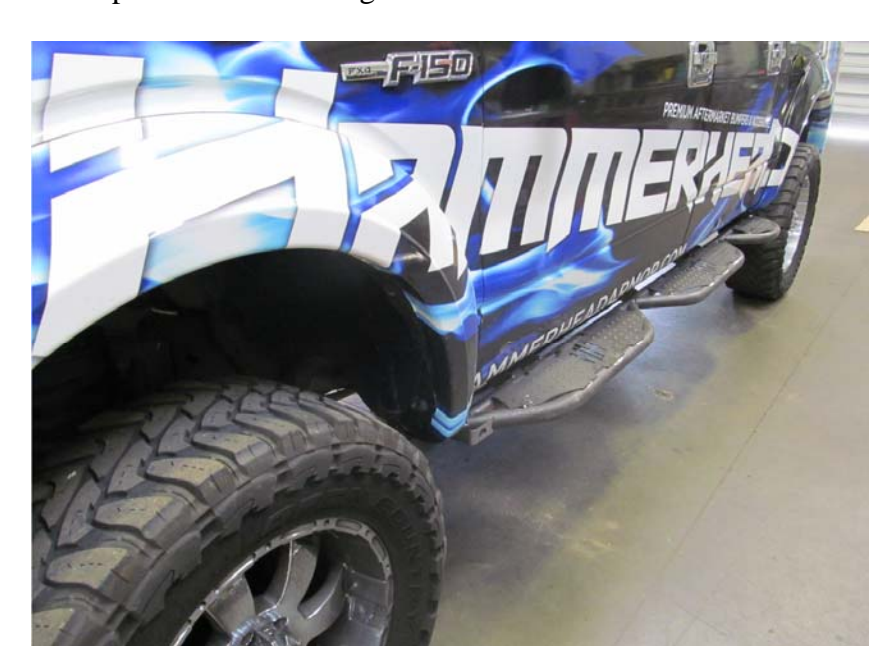
Congratulations! Your bumper installation is now complete. Thank you for your purchase.