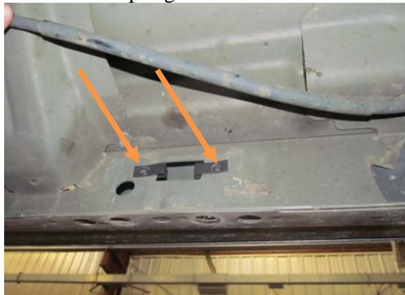
Middle mount - 1 spring nut