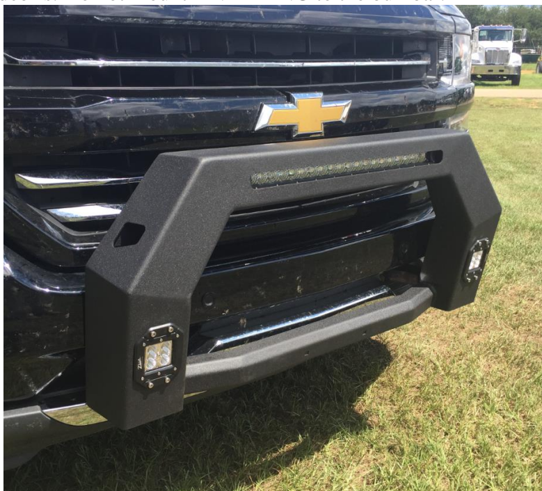
Congratulations! Your product installation is now complete. Thank you for your purchase.

This Bull Bar is sensor compatible, but it will need a little care to remain so. The Bull Bar must remain clean and free of any debris. Do not mount ANYTHING to the bull bar.