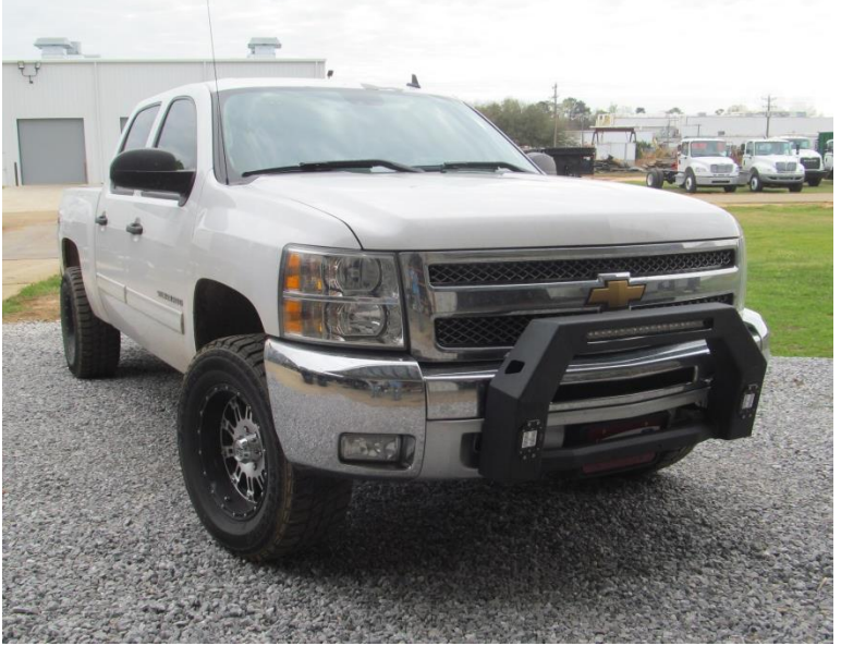
Congratulations! Your product installation is now complete. Thank you for you purchase.

6. Have a friend help you align the Bull Bar. Push top of Bull Bar toward truck. Using a ¾" socket and wrench, tighten the frame mount bolts at this time. Use torque values on page one. Verify top of Bull Bar is level with ground.